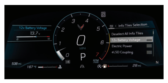
See Instruments and Controls in your Owner's Manual.