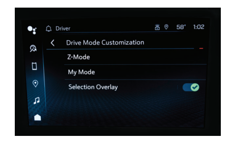
See Driving and Operating in your Owner's Manual.